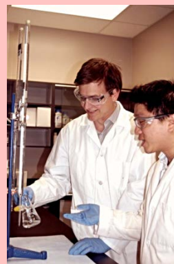
Water Reuse Systems (CSA Standard B128.3).

EWMCE has been working on an exciting new initiative: our accreditation by the Standards