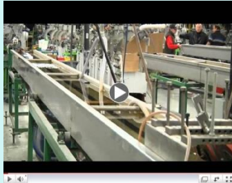
Canada's EPS & XPS Polystyrene Foam Recycling Technology